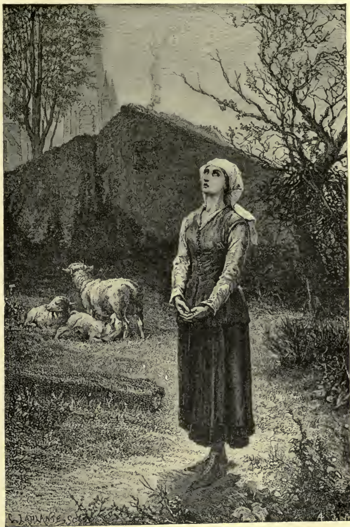
JOAN OF ARC